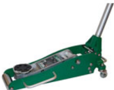
Aluminum Racers Jack with LED Lights